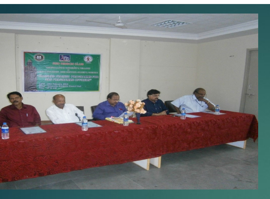
itaries sitting on the dais