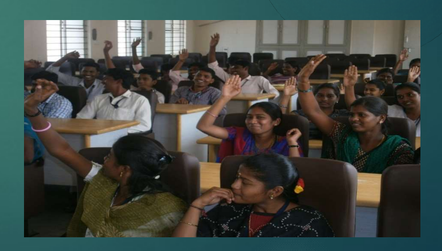
Response of student volunteers