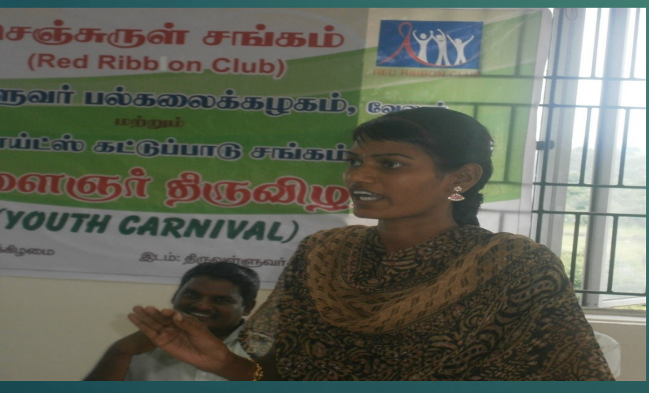
thi, student volunteer interacting with resource