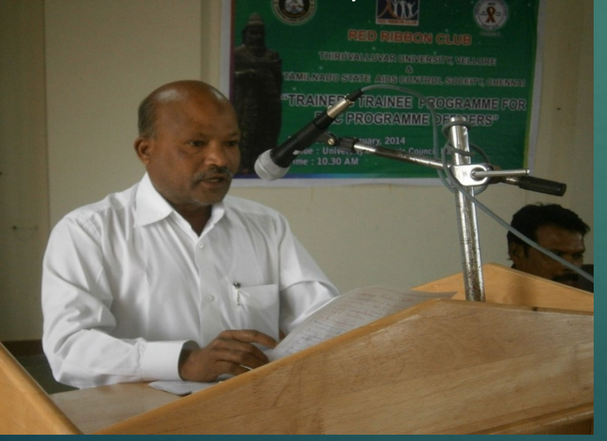
e person address on HIV/AIDS impact in the society