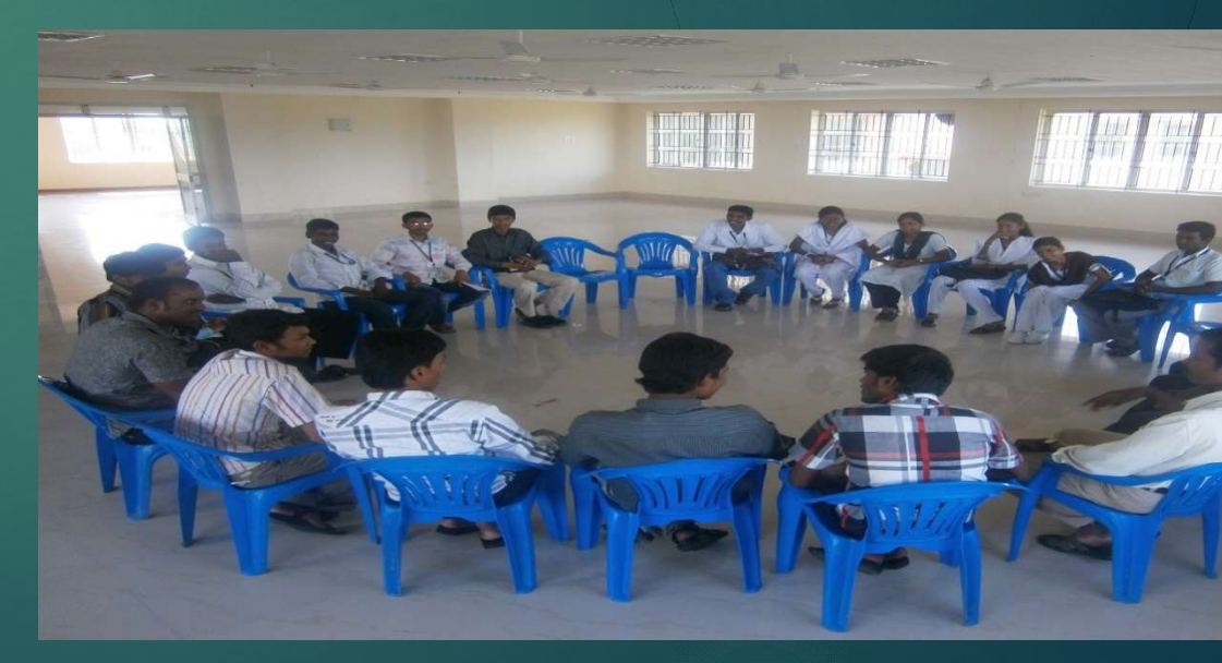
Group discussion with resource persons and volun